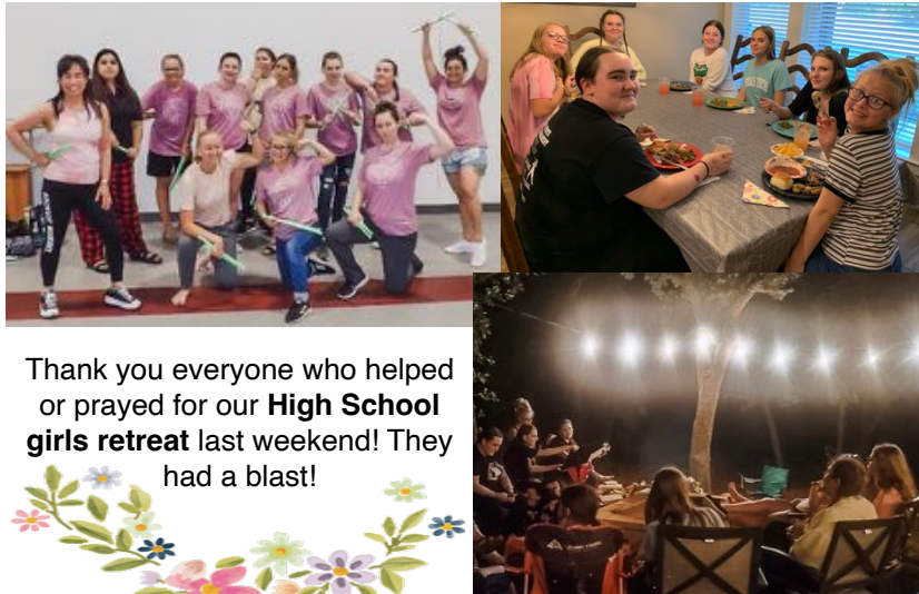
Thank you everyone who helped or prayed for our High School girls retreat last weekend! They had a blast!